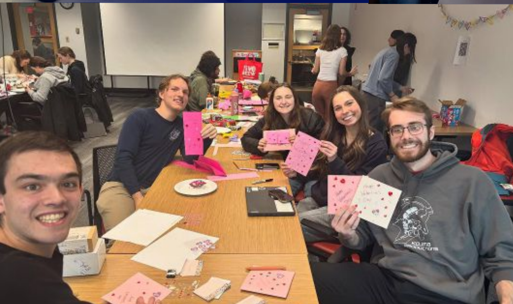
NY G: Valentine's Day Card Making — @tbpnygamma

Thanks for posting your chapter events on social media! These images were featured on the chapters' Instagram accounts. Be sure to follow each of them to stay involved with Tau Bates across the country. Keep posting!