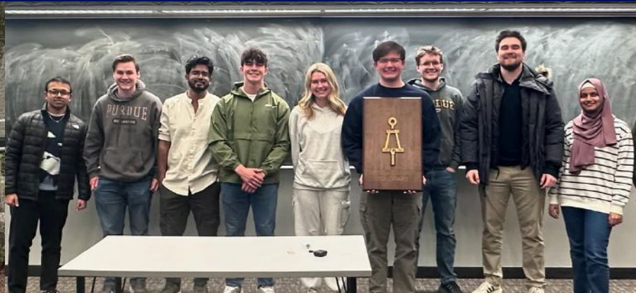
IN A: First AMM (All Member Meeting) — @purduetbp