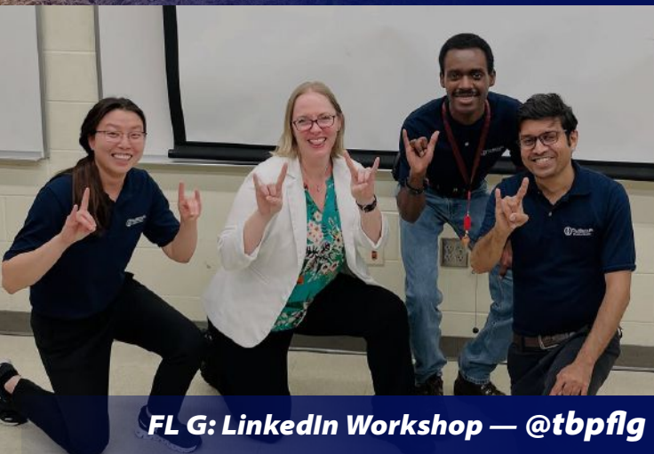
FL G: LinkedIn Workshop — @tbpflg