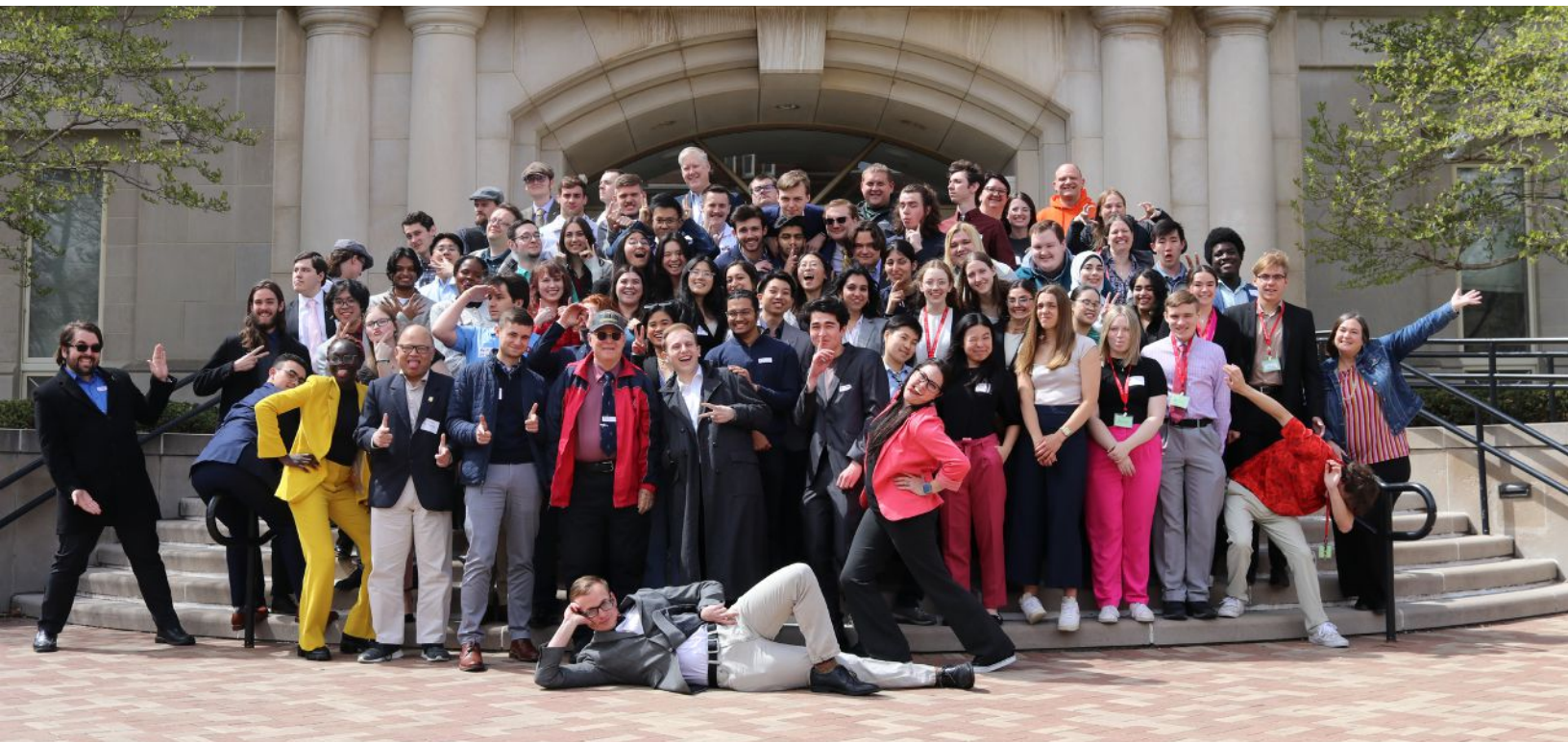
District 7 Conference in 2024