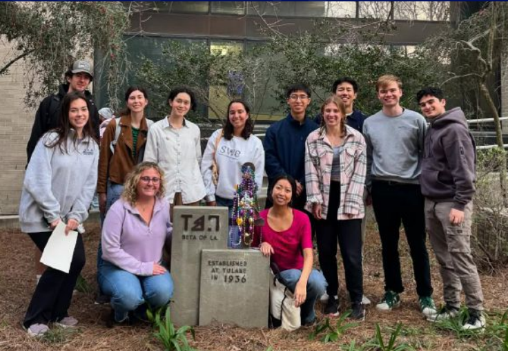
LA B: Mardi Gras Bent Decor