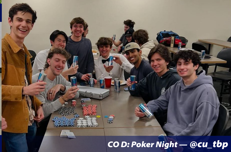
CO D: Poker Night — @cu_tbp